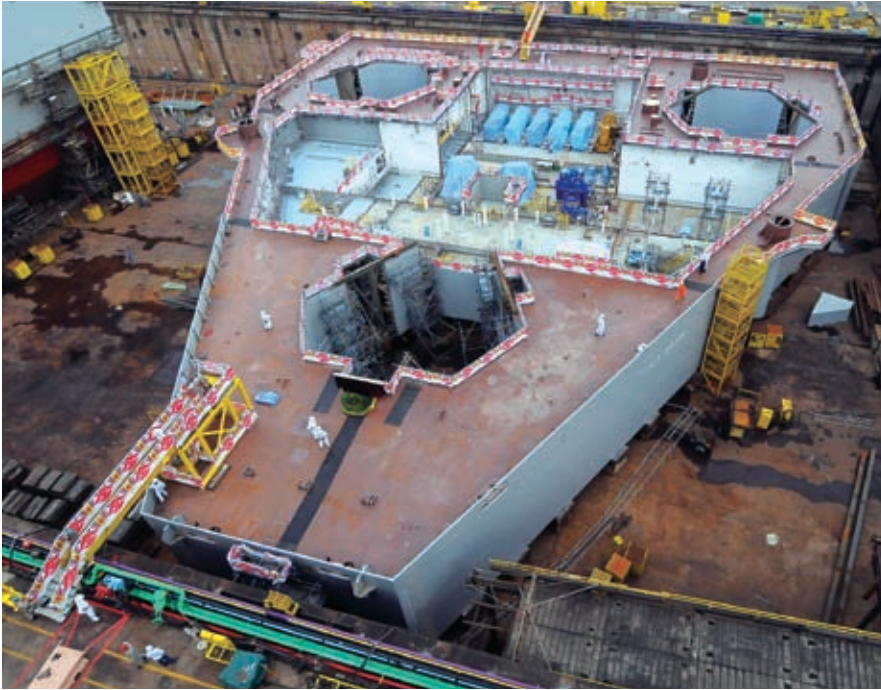
The complete lower hull, comprising ten lower hull blocks, was joined together in this first-of-its-kind keel-laying ceremony

From Singapore to Kazakhstan, Keppel yards worldwide make timely progress and achieve safety milestones on their projects.