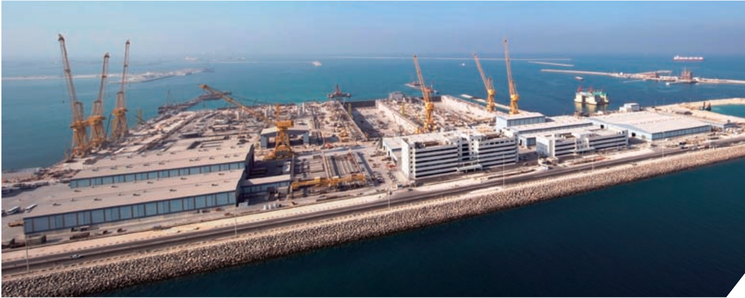
(From left) N-KOM seeks to establish itself as the region's new centre of excellence for offshore and marine services; Chartered by Qatargas, the LNG carrier Al Wakrah marks an important milestone in the partnership between N-KOM and MOL

Qatar's highly anticipated mega shipyard facility, Nakilat-Keppel Offshore & Marine (N-KOM), opened its doors last November to the keen reception of ship and rig owners in the Middle East.