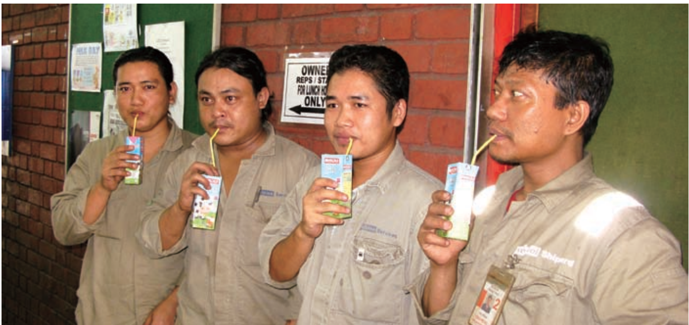
To promote a healthy lifestyle amongst its employees, Keppel Shipyard held Milk Day on 18 March 2011 and gave every employee a nutritious packet of milk