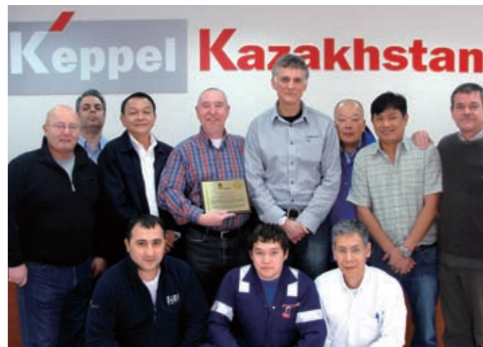
In recognition of its commitment towards zero accidents, Agip KCO presented Keppel Kazakhstan with an award

supervisors to identify unsafe acts and hazards. They also attend courses such as safety leadership and confined space training.