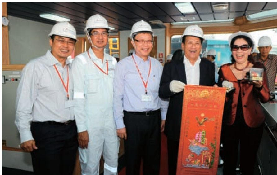
Managements of Keppel Singmarine and Straits Corporation celebrate the naming of the transshipment barge Straits Venture