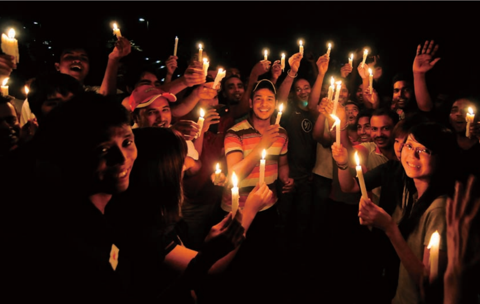
Students from the Singapore Polytechnic and staff from Keppel Housing observe Earth Hour with Keppel's foreign workers

Keppel O&M's yards in Singapore and the Philippines rallied together to do their part for the environment, pledging support for the Earth Hour, an initiative by the World Wildlife Fund.