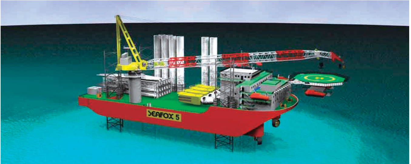
SEAFOX 5 has secured its first offshore wind farm charter in the North Sea worth over EUR 35 million

Keppel FELS' offshore wind turbine installation vessel has won its first charter contract from Aarsleff Bilfinger Berger (ABJV) Dan Tysk, worth over EUR 35 million. The vessel, SEAFOX 5, is jointly built and owned through a 75/25 joint venture company between Keppel FELS and Seafox Group, a leading provider of offshore accommodation and multi-support service jack ups.