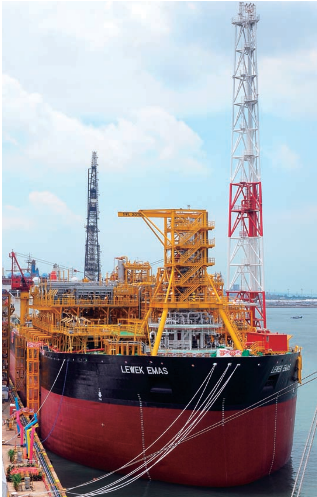
One of Vietnam's largest FPSOs, Lewek Emas, built by Keppel Shipyard

"In spite of the tight schedules, Keppel and EMAS have worked closely together to ensure that the project works are carried out with the highest standards of quality. The successful conversion of