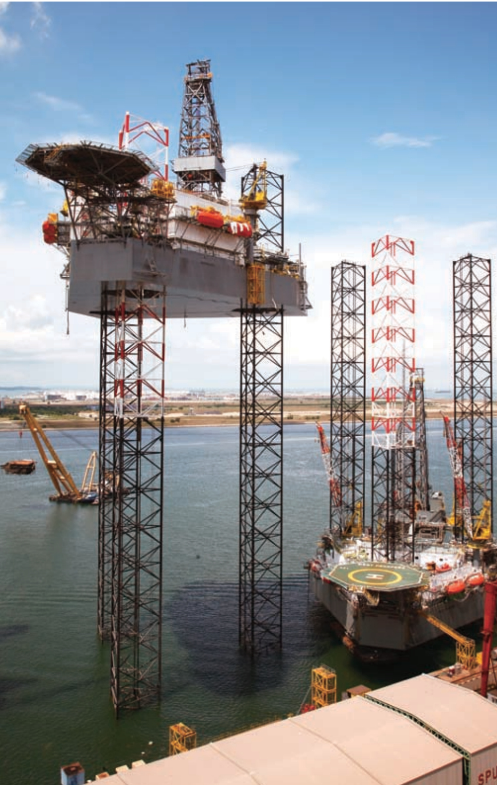
Keppel FELS has secured orders for ten KFELS B and Super B Class rigs in the past six months

Win-win partnerships have enabled Keppel O&M group to secure three rig orders from its global customers.