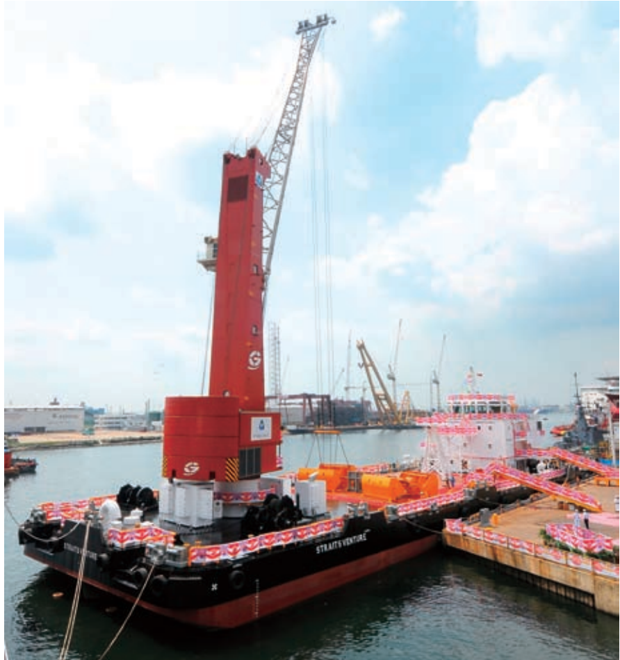
Keppel Singmarine was awarded a $5,000 bonus for the incident-free construction of the Straits Venture coal transshipment barge

Capable of loading 30,000 tonnes of coal per day, this barge is able to operate under challenging transshipment conditions at sea, and has the flexibility to support other marine operations for the oil and gas industry.