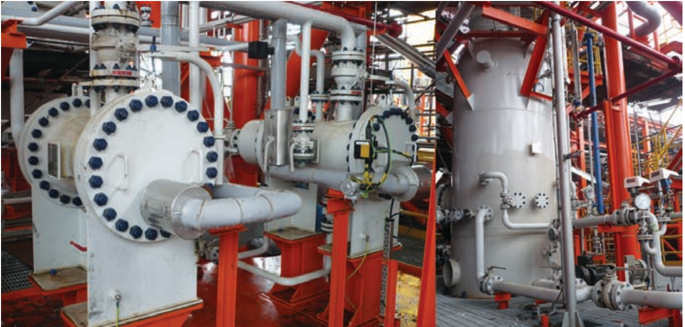
The existing water treatment system in the market is unable to separate the hydrocarbons from the produced water completely, leaving remnants of 0.1% to 10%.

Produced water, or water associated with reservoir fluids in drilling activities, comprises 98% of the waste water generated from oil and gas operations. Over the past decade, the increased output of such waste water has aroused environmental concerns and posed a significant waste management challenge for oilfield operators.