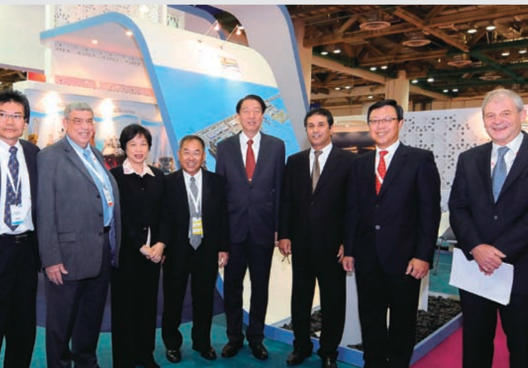
(centre) together with Singapore's Deputy Prime Minister, Mr Teo Chee Hean (fourth from left) and partners from Nakilat at Sea Asia 2011

A full day of the conference was set aside to discuss the developments, role and potential of offshore oil and gas in the Asian energy mix, and the engineering challenges faced as the industry moves into deeper waters and more demanding environments.