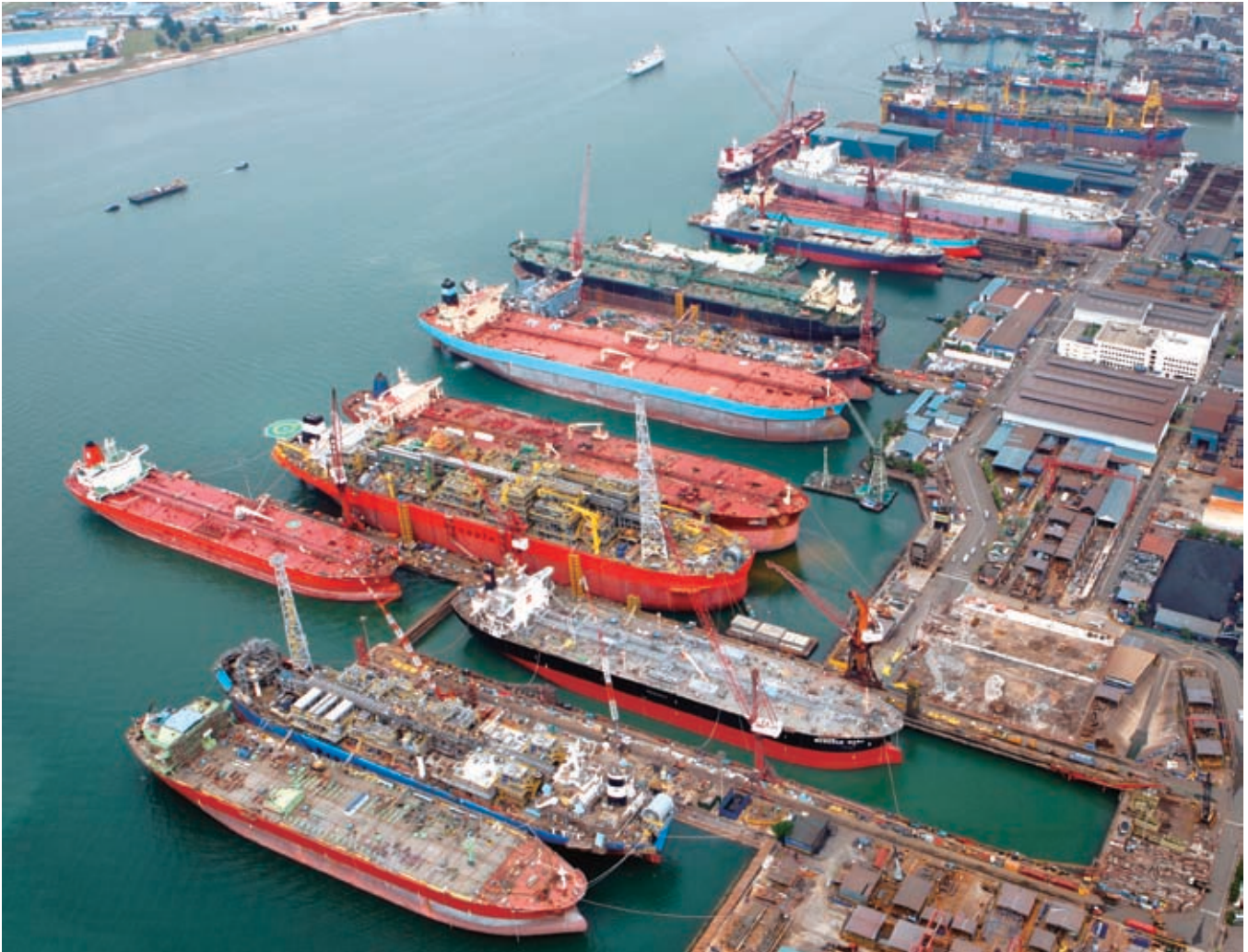
Keppel Shipyard has built up a track record of delivering quality projects competitively and with high standards of safety

Keppel O&M, through its wholly-owned subsidiaries, Keppel Shipyard and Keppel Singmarine have clinched four marine orders from international customers over the past two months.