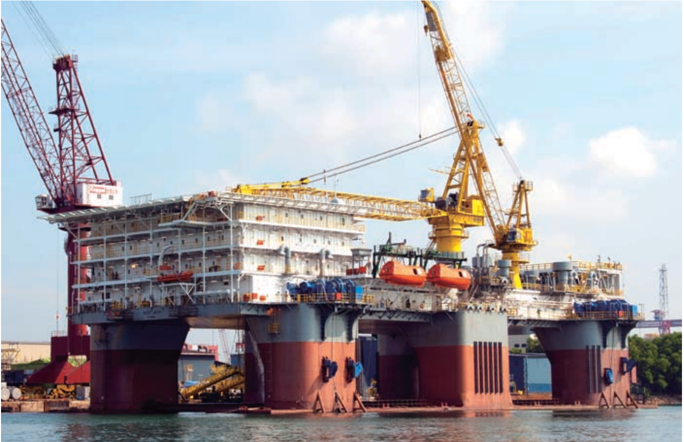
West Jaya was delivered more than two weeks ahead of time, with a perfect safety record and within budget

Keppel FELS has delivered its seventh KFELS semisubmersible drilling tender (SSDT), West Jaya, to Seadrill. Completed two weeks ahead of schedule, the vessel was delivered with a perfect safety record and within budget.