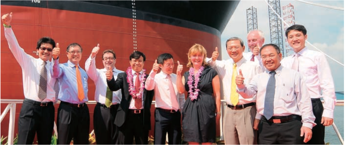
The managements of Keppel, EMAS and premier Oil celebrate a stellar partnership and the successful conversion of FPSO Lewek Emas

Lewek EMAS further enhances Keppel as the choice provider of reliable and value-added marine services."