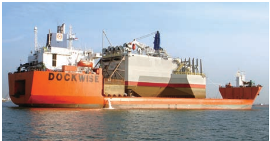
Completed safely and ahead of schedule, the stern block module for Noble Leo Segerius was transported from Singapore to Brazil in about 30 days

Keppel FELS promptly on 5 March 2011 for its deployment off Broome in the Browse Basin of Perth, Australia.