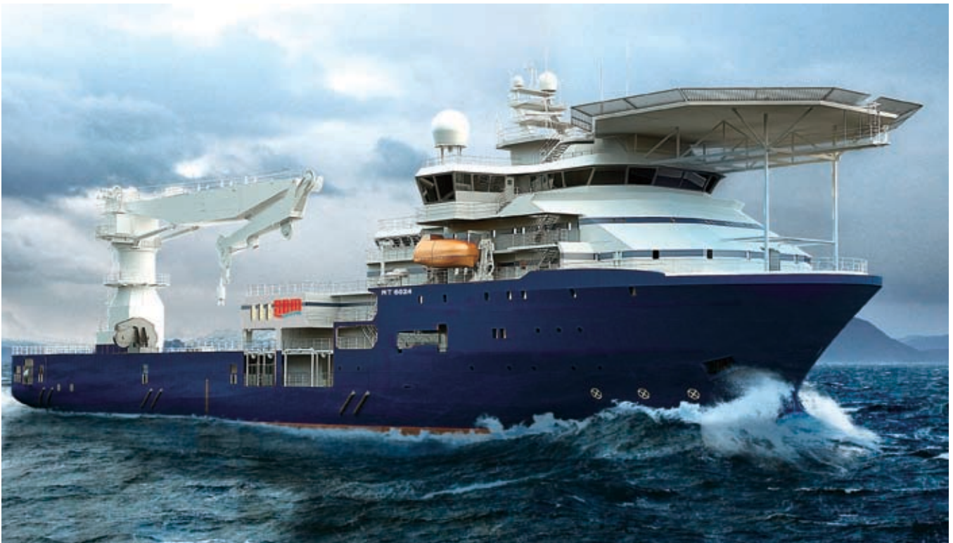
Keppel Singmarine will build for SBM Offshore a prototype multi-purpose DSCV scheduled for delivery in 2Q 2013

The third contract that Keppel Shipyard secured was a fast-track project for the upgrading of an FPSO vessel from Petrofac International (UAE) LLC, a subsidiary of Petrofac. Work has commenced in 1Q 2011. This FPSO facility will be able to handle both oil and gas production for an oil and gas field offshore Peninsular Malaysia.