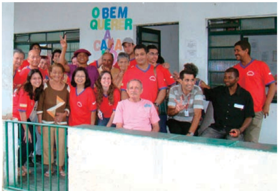
Volunteers from BrasFELS gave a fresh makeover to the O Bem Querer A Casa Do Idoso old age home