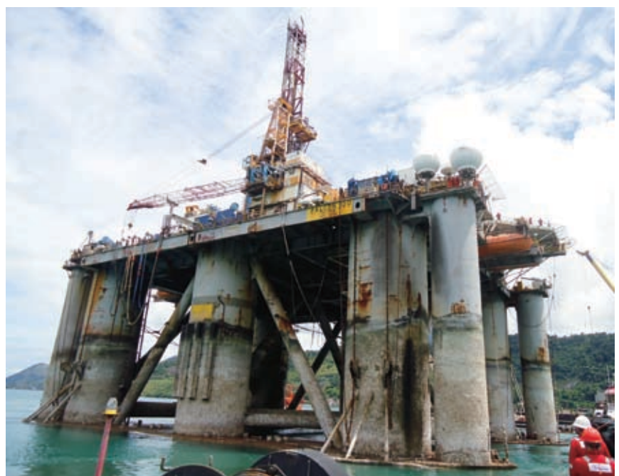
With an established track record, BrasFELS is the yard of choice for repairs in the region such as the Falcon 100 from Transocean

The second contract is from Pride Foramer S.A.S for repairs on the Pride Brazil. BrasFELS will replace 17 tons of pipes as well as install the sewage unit, helideck tie-down and backup trip tank. This is second time the rig is in BrasFELS for repairs.