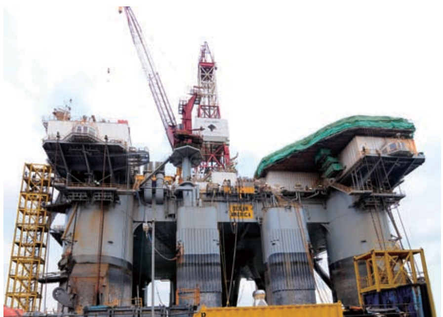
Diamond Offshore commended Keppel FELS as the upgrades to its semisubmersible rig, Ocean America, were completed on time, within budget and with zero lost-time incidents