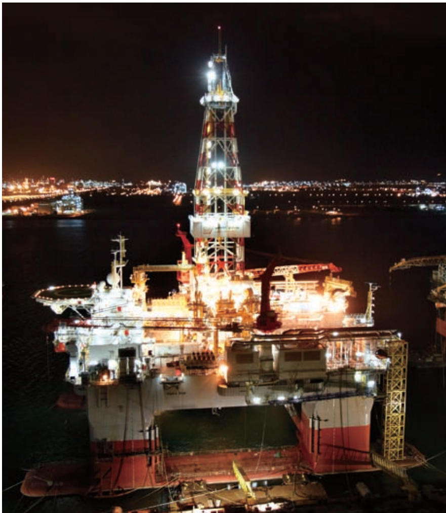
Alpha Star, the second of two DSS™ 38 semisubmersible rigs built by Keppel FELS for Brazil's Queiroz Galvão Óleo e Gás, has been delivered four months early