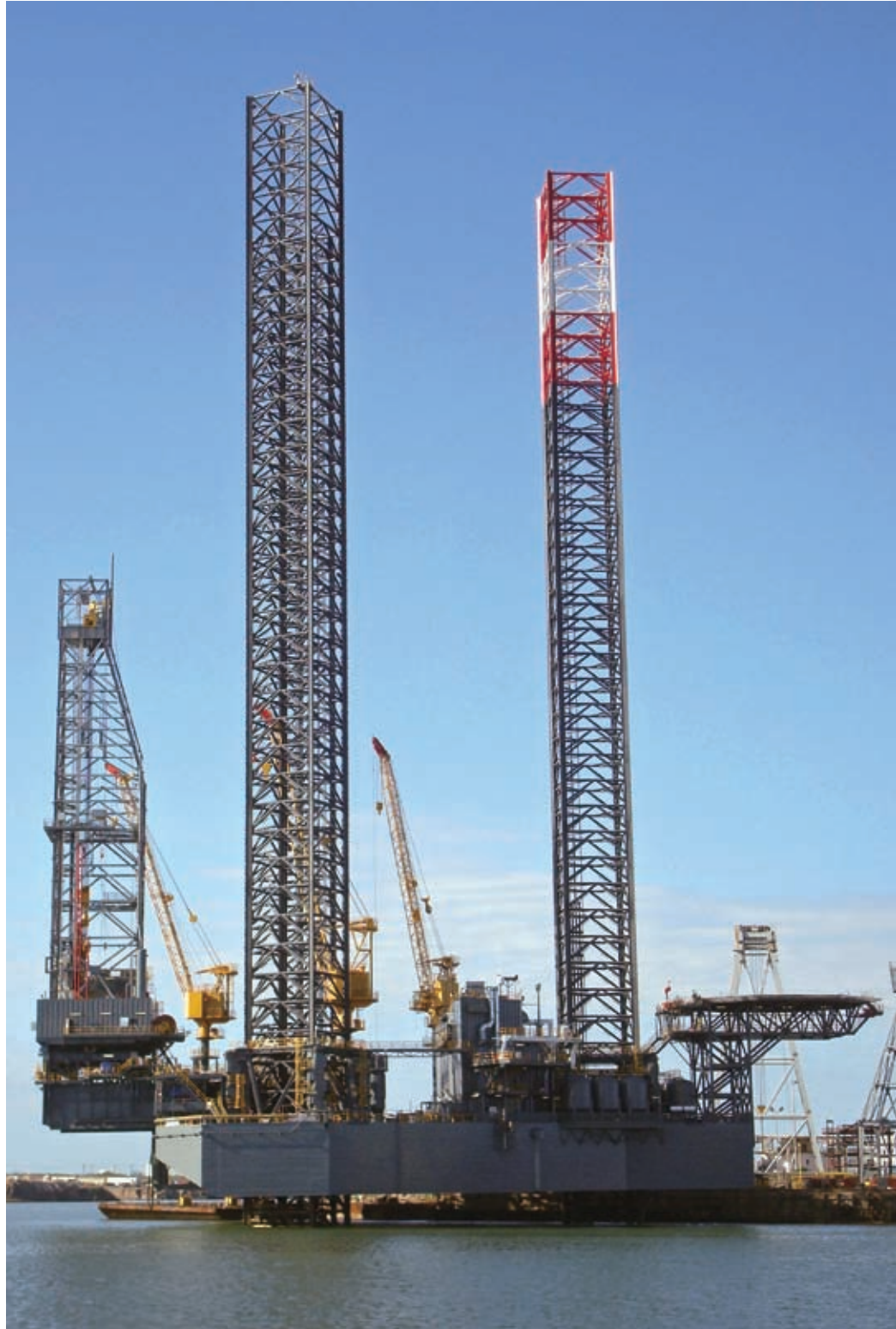
The new jackup rig for Perforadora Central will be based on the LeTourneau Super 116E design; Keppel AmFELS previously delivered Tuxpan, a LeTourneau Super 116E rig to Perforadora Central in 2010

Mexico is the world's sixth largest producer of oil and has the seventh largest natural gas