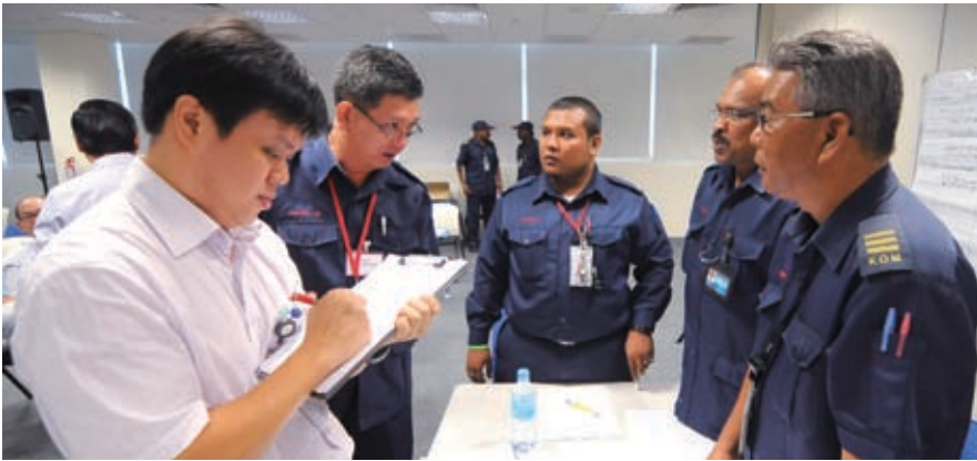
Keppel O&M's security team, the Singapore Civil Defence Force and the police exchanged views on security management

"Such discussions provide us with the opportunity to get more familiar with one another's operational procedures so that we can better respond to emergency situations should they arise in future."