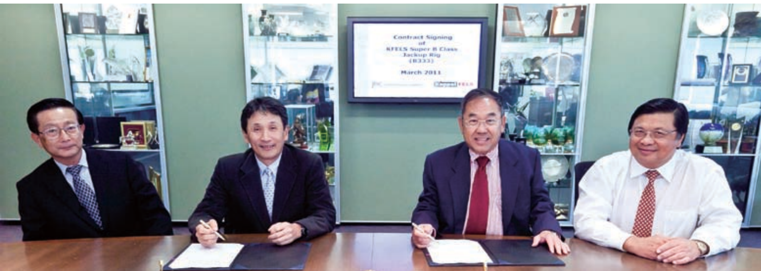
Senior management of Japan Drilling Company and Keppel set in motion the construction of a new KFELS Super B Class rig

time to expand our fleet and increase our solutions for the offshore industry. We are pleased to be able to build another rig to the highly-rated KFELS B Class design with Keppel FELS.