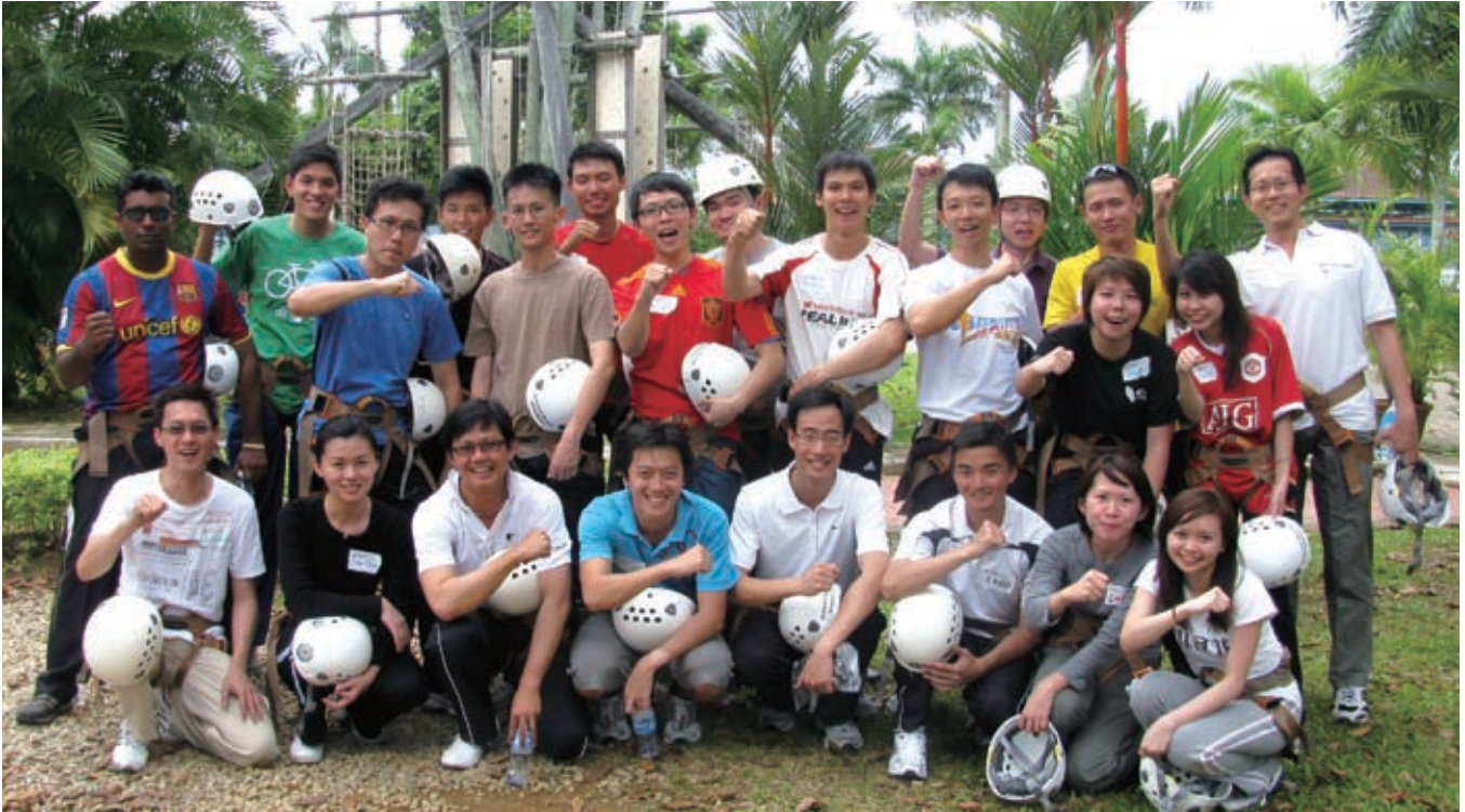
The Keppel Leadership Development programme is one of several talent development schemes offered by the Keppel College

The Keppel College held several programmes in recent months to advance the development of staff in the areas of leadership, team building and mentorship.