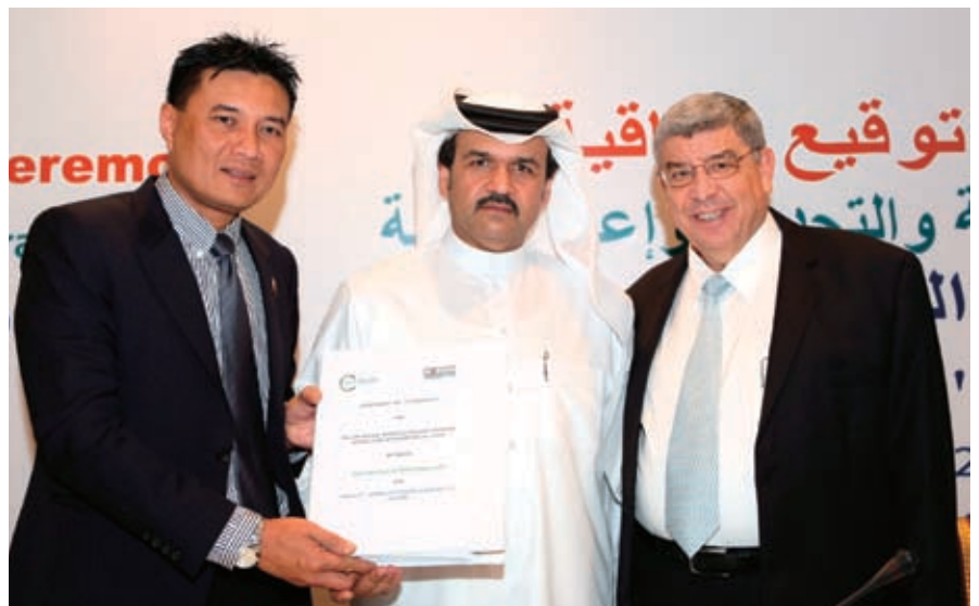
N-KOM recently clinched a contract with Gulf Drilling International to carry out critical repair, modification and upgrading works to its offshore jackup rig, Al-Doha